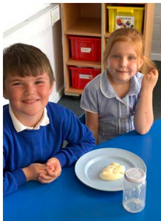
Butter making with Year One