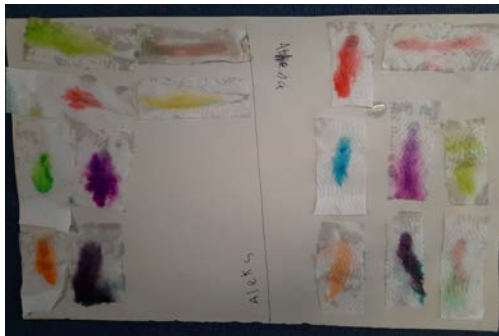
Chromatography with Year 4