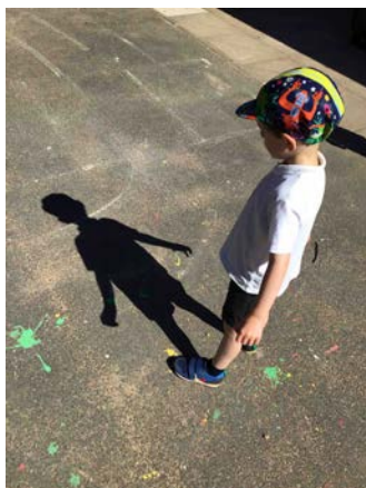
Shadows with Foundation Stage

More Science Week pictures and information will appear on the website soon