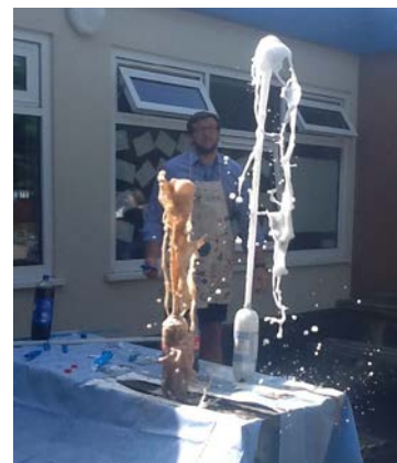
Year 5 Mentos experiments