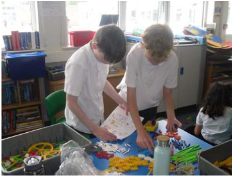
Year 6 KEX engineering