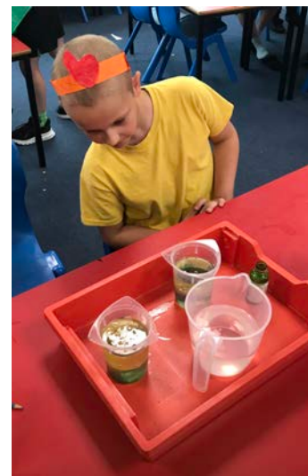
Making Rainbows in Year Three